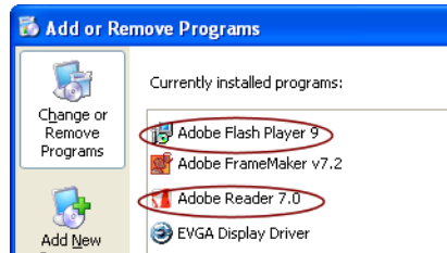
Figure 1.3 Adobe Flash Player and Reader installed

To see if Adobe Flash Player and Adobe Reader are installed, click the Windows Start button, select Control Panel , then double-click Add or Remove Programs . Wait as Windows populates the pane. Scroll through the list to see if the programs are included.